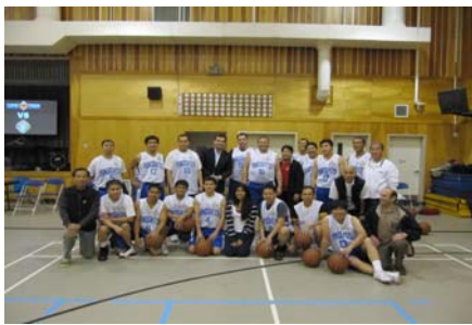
Knights Dream Team