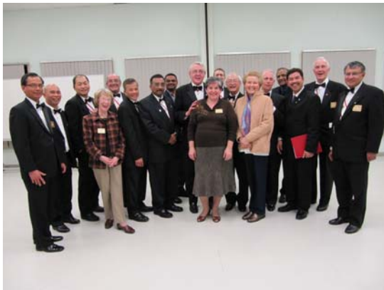
Sir Knights and their Wives