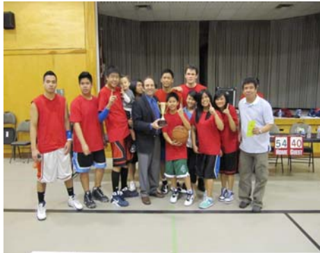
St. Anthony of Padua - Champions