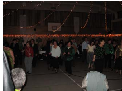
Having fun on St. Patrick's Day