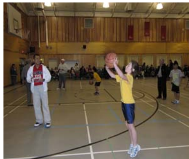
Regional F. T. Player in action