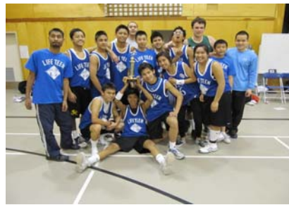
The Pride of winning