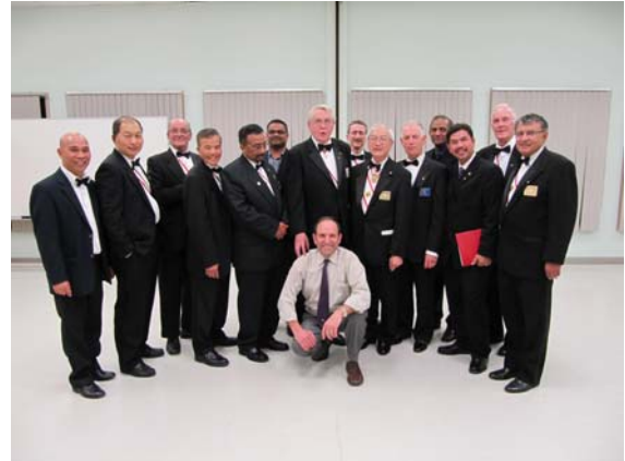
The new Sir Knights and Team