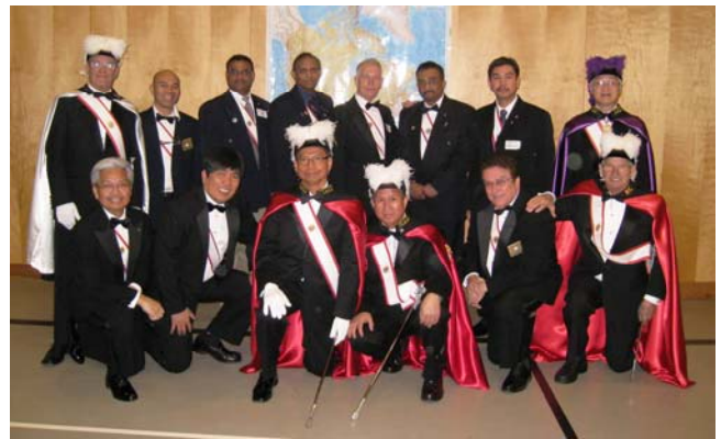
Sir Knights of the Patriotic Order