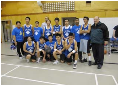
St. Paul Life Teen standing with pride