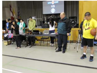
Time for Prayer