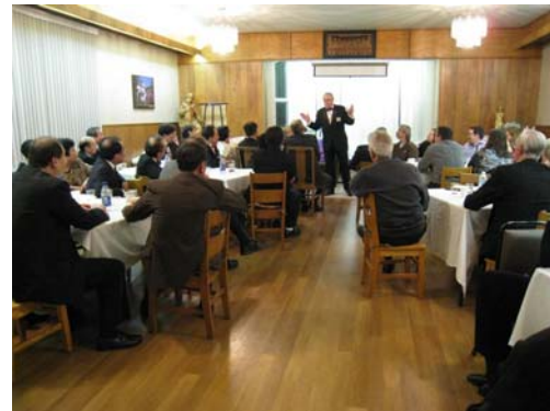
Master addressing the Sir Knights