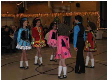
St. Patrick's colorful Irish Dancers