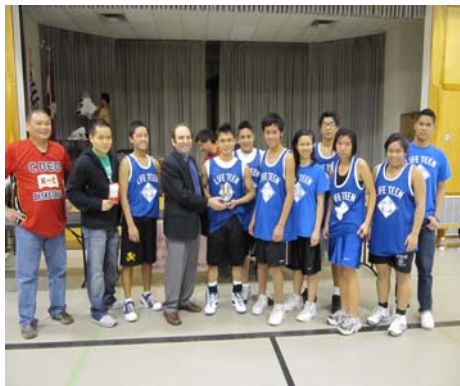
Life Teen ready for action