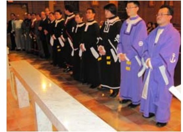
Charter Executive Officers taking their Oath of Office