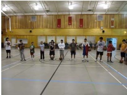
"We are the Champions"