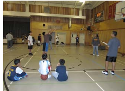
"The Shooting Stars"