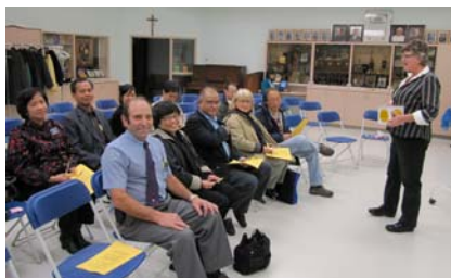
PREVENTION MINISTRY SIMINAR