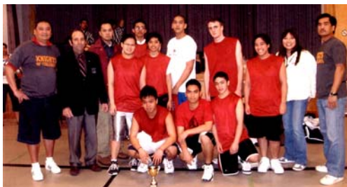
2 ND RUNNER-UP....ST. PAUL