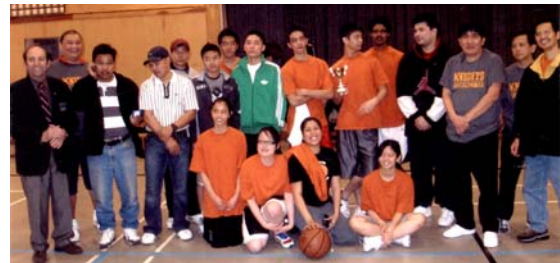
1 ST RUNNER-UP...ST. MONICA

St. Anthony’s youth team (White) emerged as champions in a thrilling finale by beating St. Monica’s youth team (Orange) 56-53 at the inaugural Coed Youth Basketball Tournament sponsored by Council 6855 held at St. Paul’s Parish Centre last April 4. Earlier in the day, St. Paul’s LifeTeen team (Red) edged out Kapamilya youth team (Black) 51-50 in an equally exciting consolation round match to capture 3 rd place.