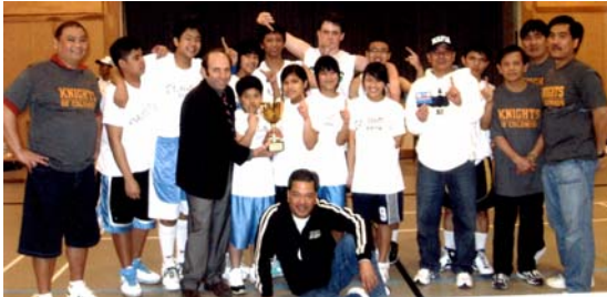
THE CHAMPS....ST. ANTHONY