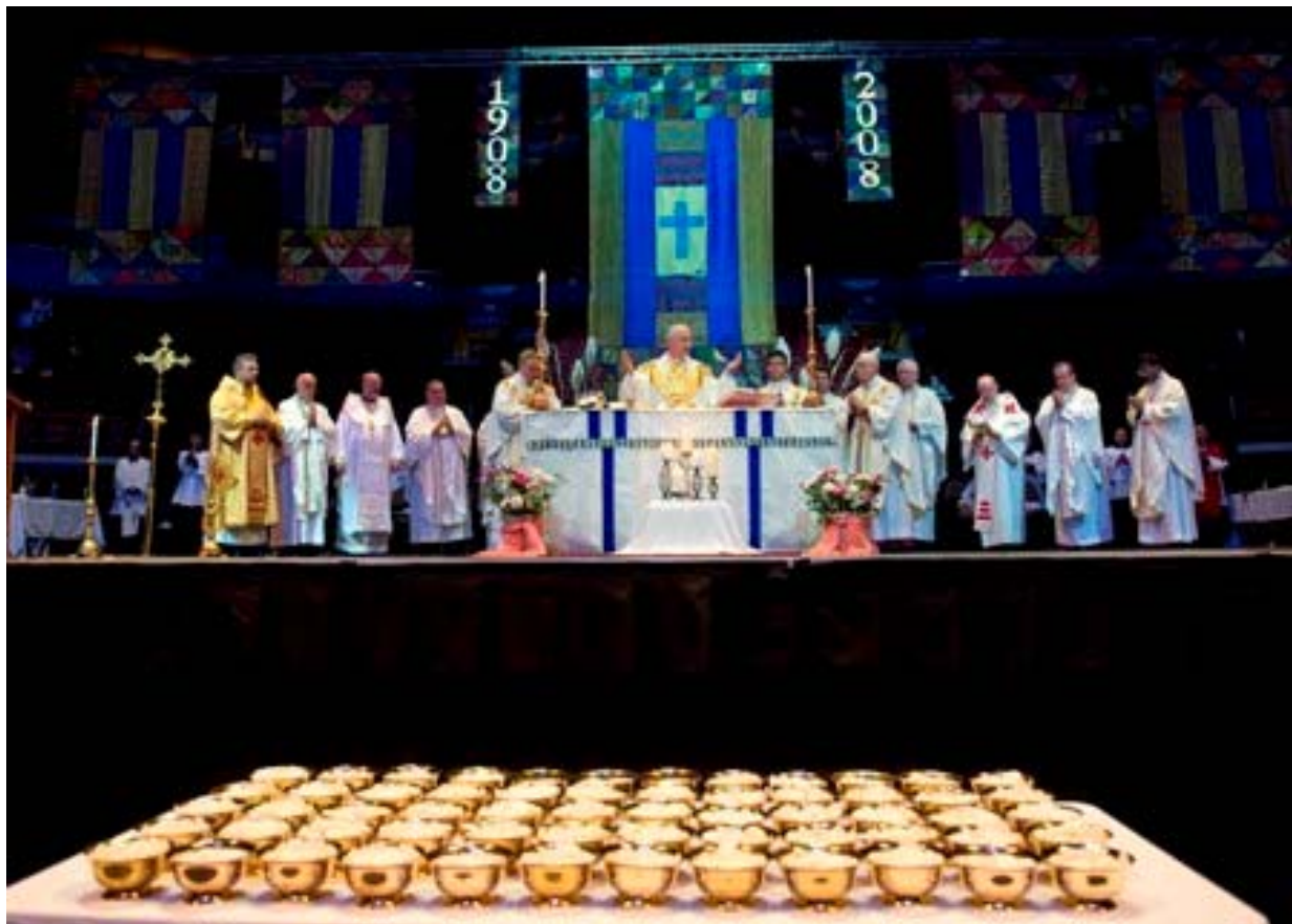
CWL Banners and Eucharist at Archdiocese 100 Anniversary at GM Place