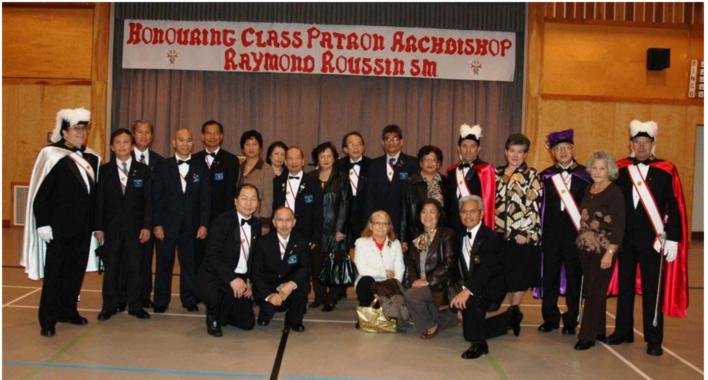
6855 new 4 th Degree members at Exemplification on November 18, 2008