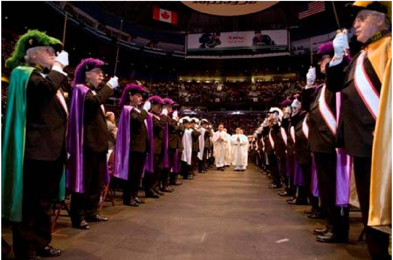
Knights Honour Guards in Action at Archdiocese 100 Anniversary at GM Place